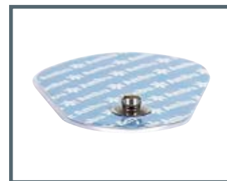
S= Stainless steel Stud